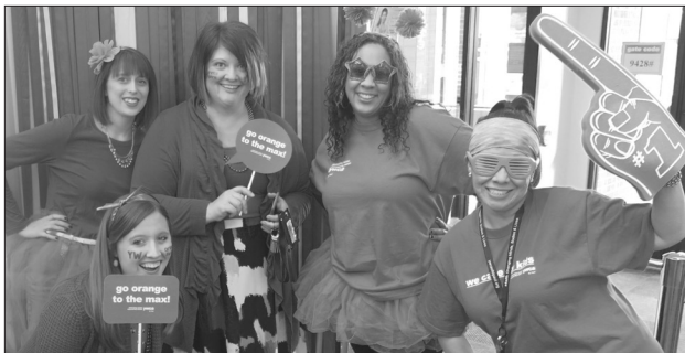
Our staff went Orange to the Max for GiveMN's Give to the Max Day! Thanks to our generous supporters, we raised over $15,000 for the women, children and families we serve.