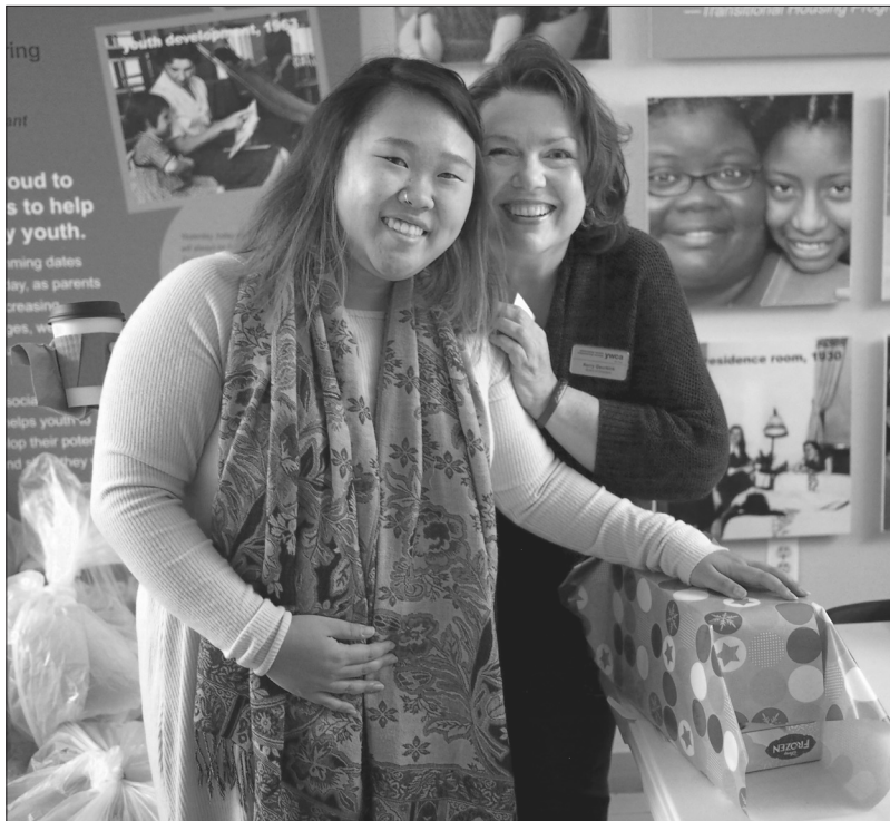
At the 2015 Holiday Wrapping Party, our members, donors and friends wrapped more than 900 gifts donated to families fighting homelessness.