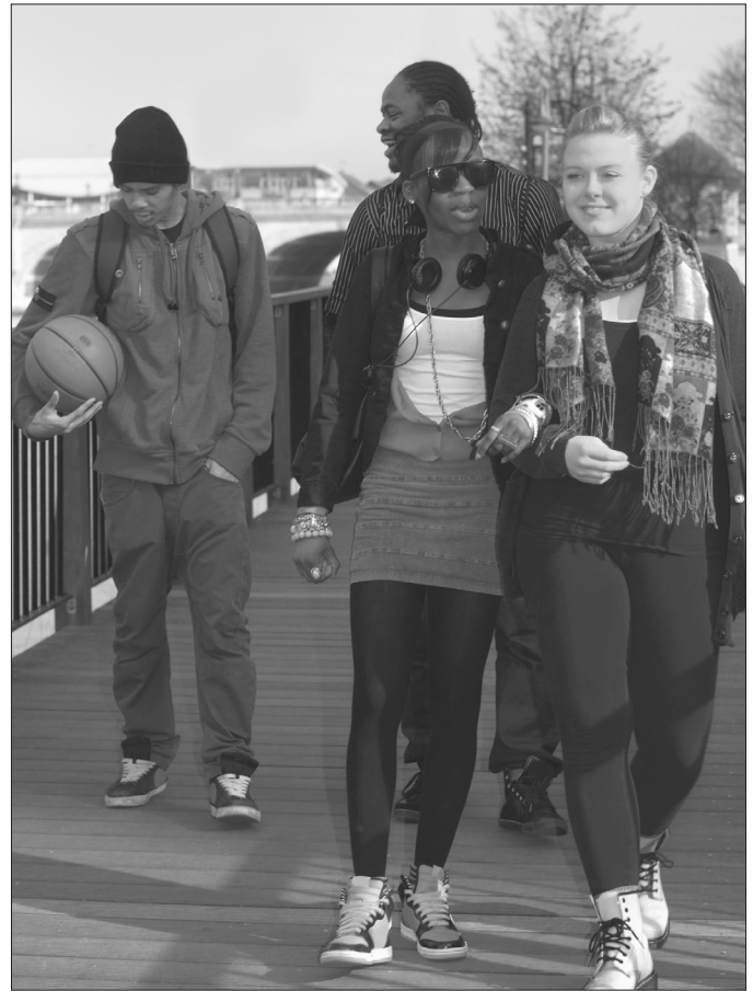
The Community Ambassadors help engage teens and stop trouble before it starts.

To better meet the needs of the growing initiative, this spring exciting changes are ahead. The program administration function will transfer to another service provider and the initiative will relocate to new office space. YWCA St. Paul is proud to have played a role in the launch of Community Ambassadors and looks forward to future opportunities to collaborate and support this important community work!