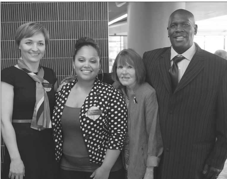
2015 Sweet Success Honorees