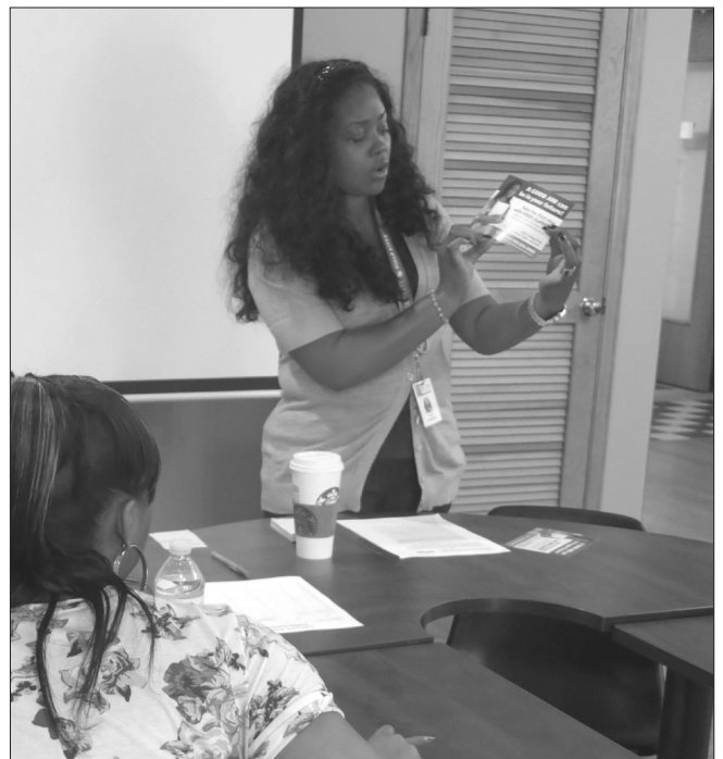
With help from the YWCA St. Paul, job seekers can earn a GED.

This project was made possible thanks to funding from Ramsey County Workforce Solutions.