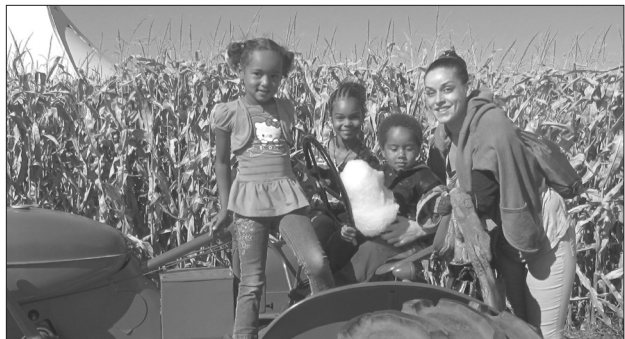
Generous community support made a trip to the corn maze and pumpkin patch possible for families in our Transitional Housing Program (THP).