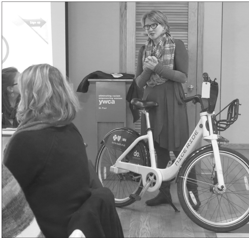
With training from Transit for Livable Communities, our Housing & Supportive Services staff are now better equipped to help families access a wide array of transportation options throughout the metro.