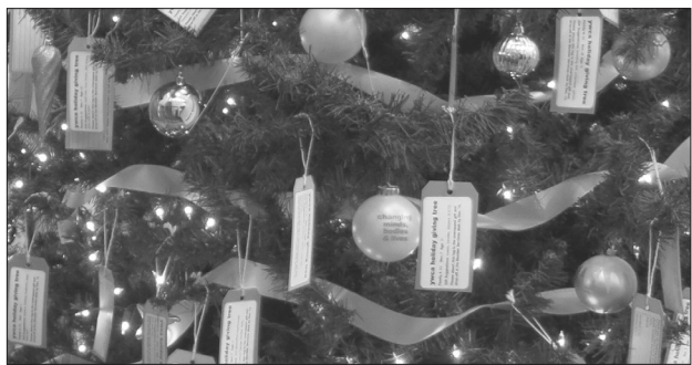
Giving Trees located in our Health & Fitness Center are decorated with wish lists from families in need. Gifts will be collected through December 12.