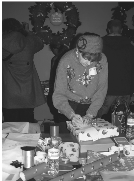
At the 2012 Wrapping Party, YWCA members and friends wrapped 500 gifts for families fighting homelessness.